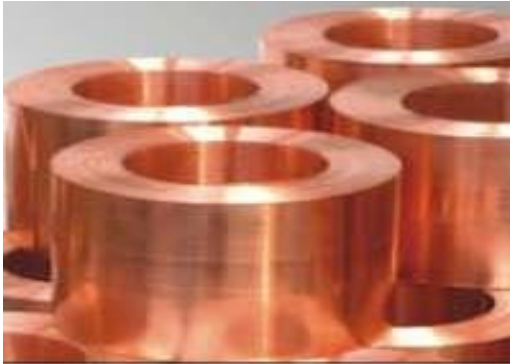
16 oz. copper coils

We use the finest copper sheet and copper coil to create your awnings at Cannon Copper.